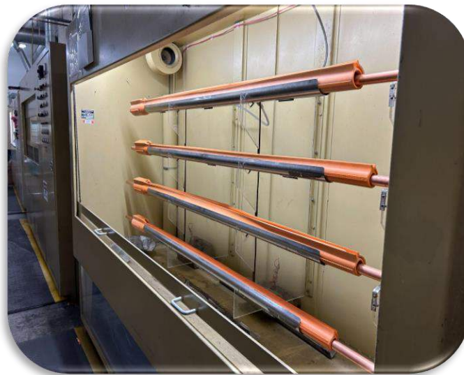
Figure 2 - Line Hose Dielectric Testing

Once the line hoses are completely dry, they are transferred to our specialized Line Hose testing machine. This cutting-edge equipment is designed to accommodate line hoses of all classes, styles, and sizes. Each line hose is fitted with a metal rod and secured with a metal shell clamp to energize both the inside and outside of the line hose. Our advanced machines have the capability to test up to four line hoses simultaneously, enabling efficient testing of large quantities per day. This comprehensive testing process ensures that each line hose meets the required standards for dielectric integrity and electrical safety.