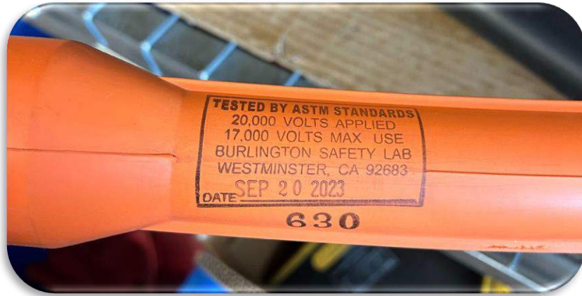
Figure 4 - Stamp

information is readily accessible for each line hose, facilitating effective monitoring of testing history and compliance with safety standards.