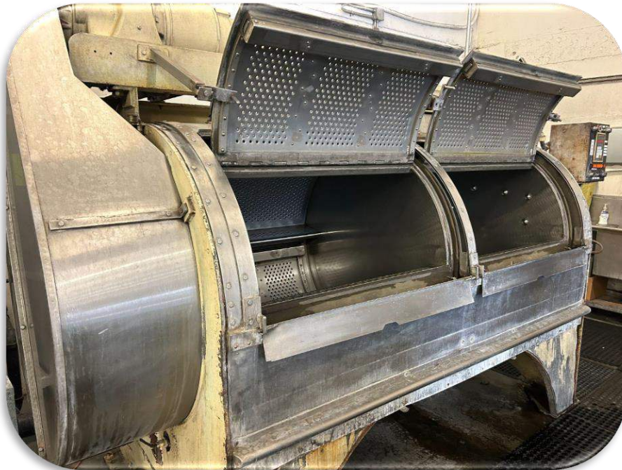
Figure 1 - Industrial Cruise Line Washing Machine

Line hoses undergo a rigorous laundering process in accordance with ASTM Standards to ensure optimal cleanliness and adherence to safety regulations. Employing an industrial cruise line washing machine guarantees thorough cleaning, effectively removing all traces of streaks, stains, dirt, dust, oils, and other contaminants that may compromise the insulation properties of the line hoses. Additionally, this cleaning process ensures the removal of any stamps and markings from previous test certifications, providing a clean surface for subsequent testing procedures.