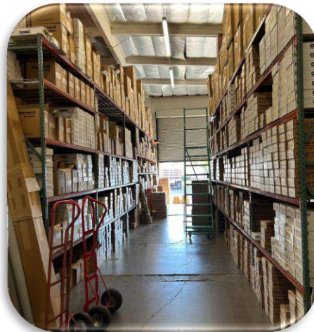
Figure 5 - Shipping or Pickup